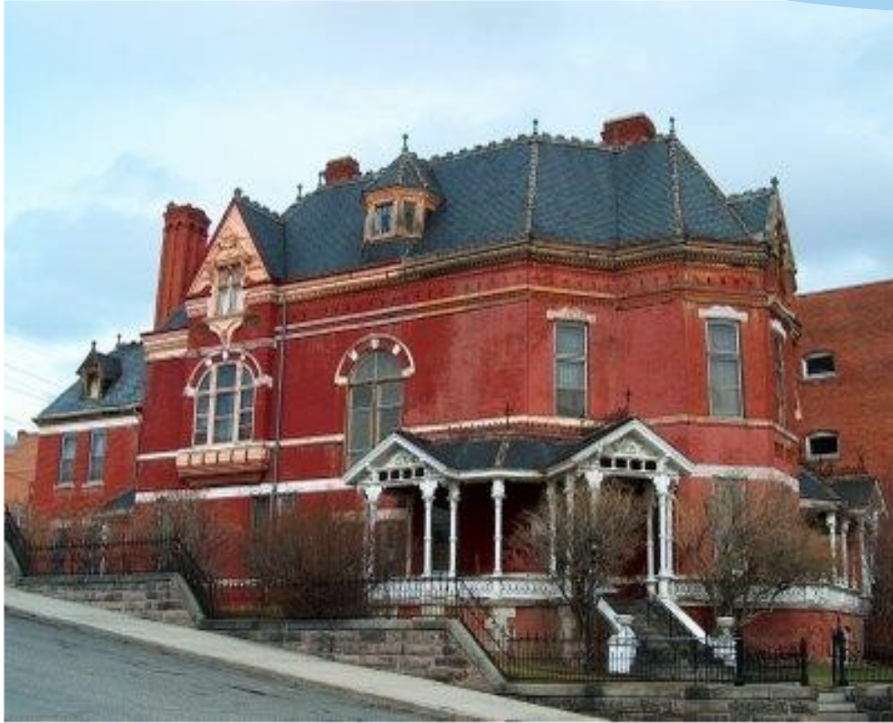
Copper King Mansion