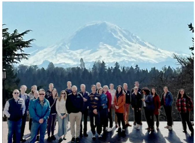
Same photo as Misbah saw it!!!