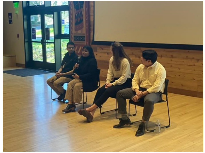
Former Clerkship students take turns answering questions.

focusing on wellness in medical education, and shifting away from grading to focus on learning.