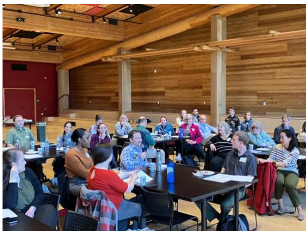
Attendees introduce themselves and provide site updates.

COPD, a plug for tobacco cessation, home oxygen, when to think about advanced therapies and pulmonary referral, and COPD exacerbations.