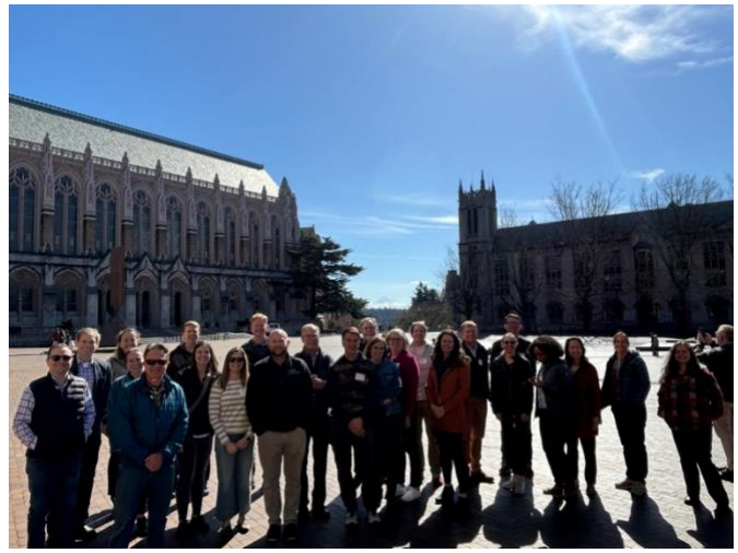
Attendees with Rainier Vista in the backdrop.