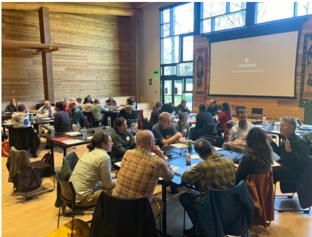
Attendees break into small groups to discuss best practices.