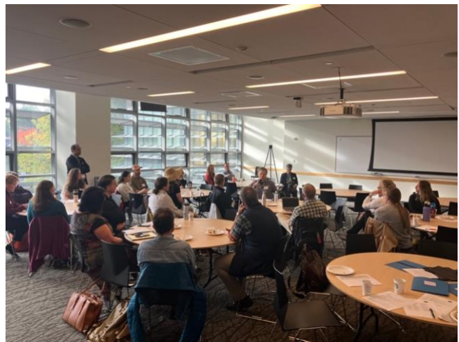
Attendees began the morning by giving introductions and site updates.