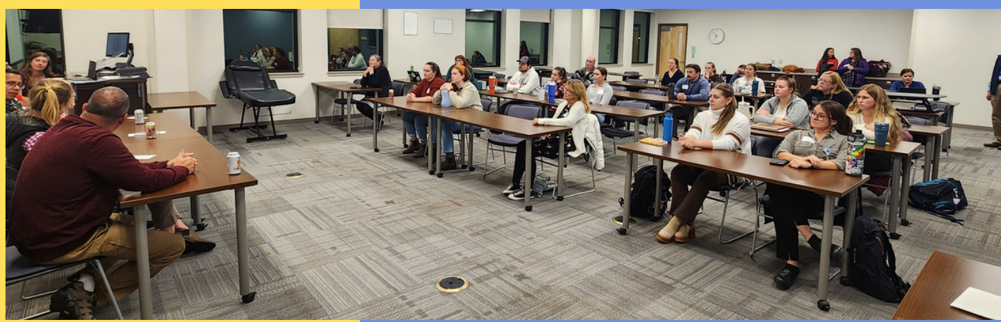
November 1, 2023 -- Bozeman, MT Panel discussion on rural physician well-being