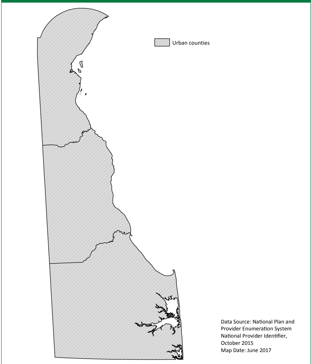
Psychiatrists in Delaware Counties per 100,000 Population

Data Source: National Plan and Provider Enumeration System National Provider Identifier, October 2015 Map Date: June 2017